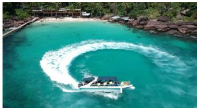
Phu Quoc Speed Boat