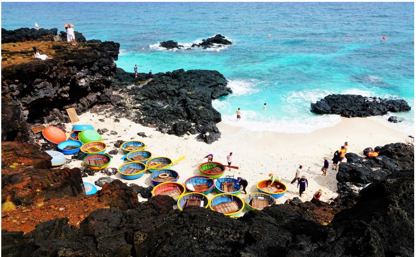
Phu Quoc Beach