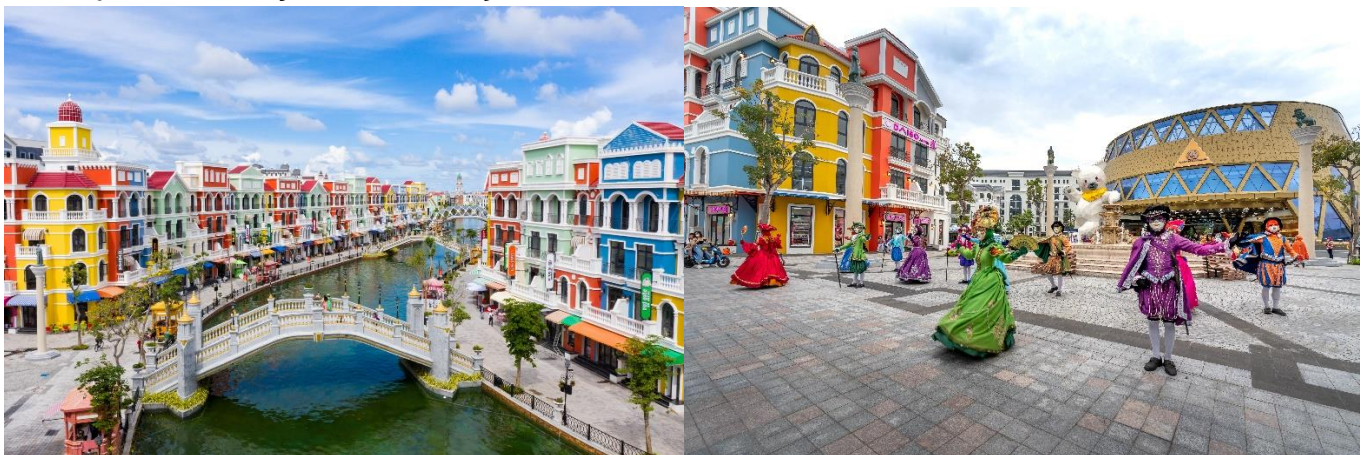
Grand World Phu Quoc

* Grand World: An entertainment and shopping complex. Additionally, its impressive architecture will provide you a great background to take a bunch of photos to capture the memories of your trip. (Optional entrance tickets at your own expense: Teddy Bear museum, Gondola Ride on the Venice River, Quintessence of Vietnam Show).