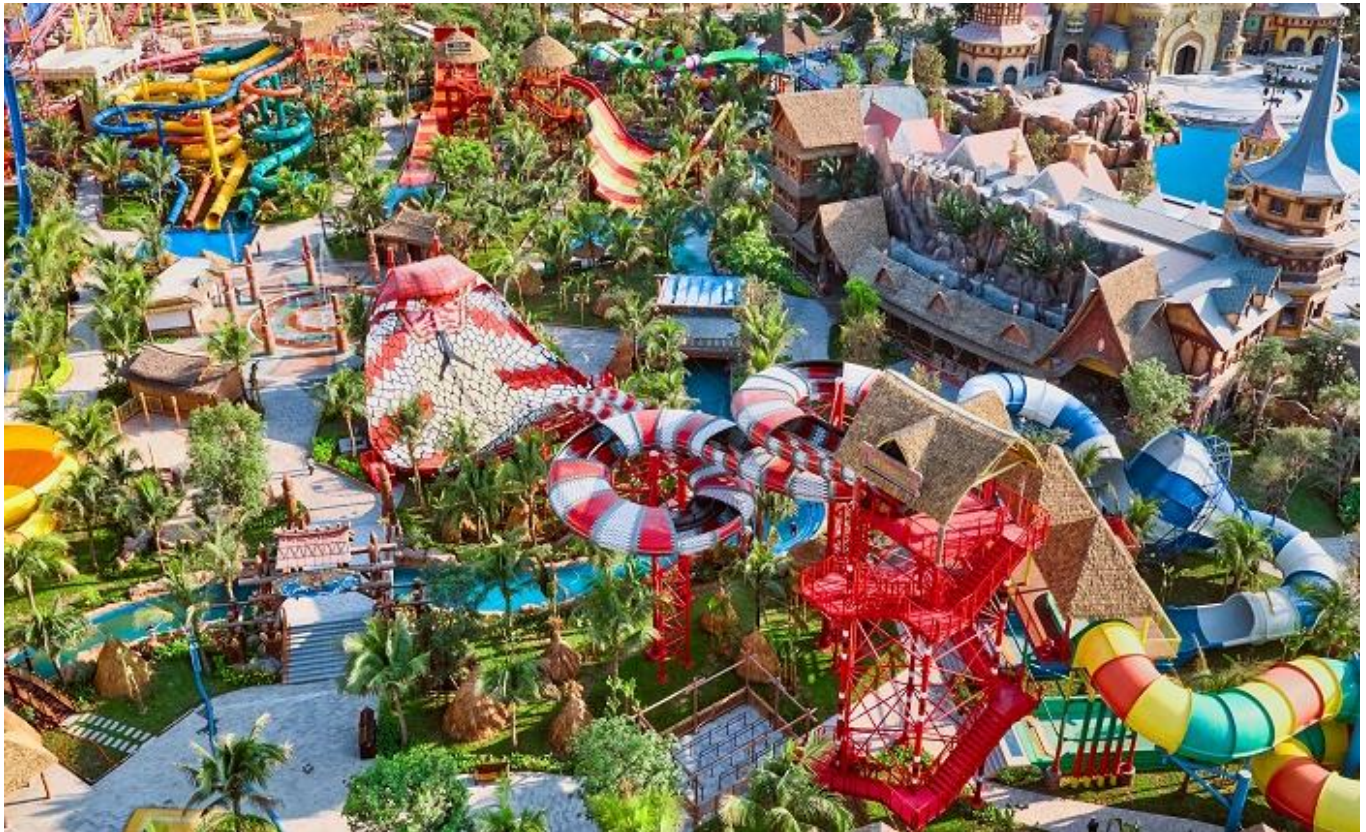
Vin Wonders Phu Quoc

In each area, there will be interesting and entertaining activities suitable for all ages.