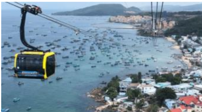
Hon Thom Cable Car

Spend time immersing yourself into nature while free diving to see starfish before heading back to the boat. Stop at Thom Island – the largest of the An Thoi islands with clean and turquoise then you will have experience with one way cable car rides. Landed to Sun Premier Village Primavera , have some photos moment with Kiss Bridge , they are not connected but separated by a distance of 50 centimeters. Annually, from 24th December to 1st January, the sun is located right in the middle of two spans, which creates a glorious and marvelous scenery on Kiss Bridge.