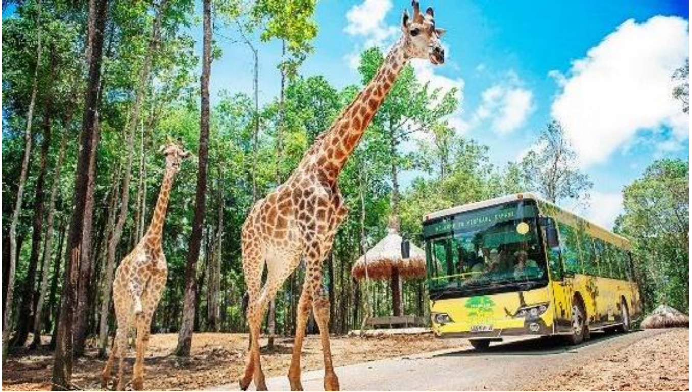
Vinpearl Safari in Phu Quoc

It is considered the common home of thousands of individuals. Among them, there are many rare animal species around the world such as: Arabian scimitar oryx, cranes, black-necked white swans... Animals here live together happily, raised in good conditions. according to international standards.